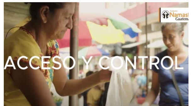
A screenshot of one of Namaste's videos about Women's Economic Empowerment. Cuchubal Match participants will view this video along with others in Namaste's Women's Economic Empowerment classes.

In 2024, Namaste's community mentors will facilitate workshops for six hundred low-income women in rural areas. Participants will learn about their rights as women, gain critical financial literacy skills, and make their own WEE plans.